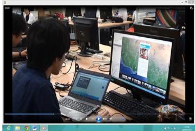
Fig. 1. Student using Google Earth.

incorporate images taken from GE for their final presentation product, which was a poster of a global issue. Global issue such as child labor and local issue such as revitalization of local community are some example of topic chosen by students. By using open data available on GE and Google Map, students were able to learn about the geographical boundaries and environment surrounding the chosen topic. Also, using functions on GE and Google Map, allows students to gain a broader perspective on a given topic without actually going to the place.