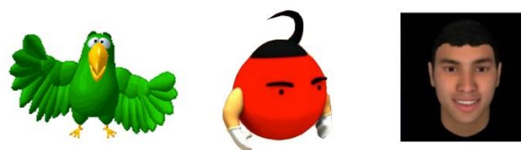
Fig. 1. (Left) – an animal-like character [9], (Center) – an object-based character [10], (Right) – a talking-head [11].

In particular, a talking-head pedagogical agent can be presented in a spectrum of extremities, from being a simple character such as animated static image to a complex one such as a 3D animation [12]. Fig. 1 shows various forms of pedagogical or virtual agent characters used in various applications.