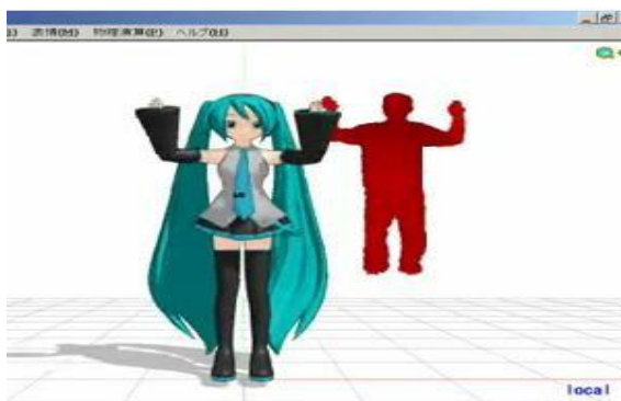
Fig. 3. MMD program with Kinect plug-in

Mikumikudance is another creativity tool utilizing the capacity of Kinect. Mikumikudance, commonly abbreviated to MMD, is a free animation program for novice animators to create 3D animations. This program has been popular among young people for its easy and quick implementation. With the advent of Kinect, a plug-in is made and expanded by Mr. Mogg to get the motion of neck, wrist, upper body, lower body, and ankle in MMD Kinect motion capture. Instead of manually manipulating joints, animators can make use of Kinect plug-in to do a quick 3D animation by acting out. Figure 3 is a screen capture of a 3D model mapping the movements of the user (the red man). The addition of Kinect to MMD lowers the technical threshold for younger students to express their creativity via 3D animation.